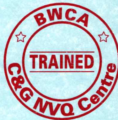
C R Mawlam Internal Verifier